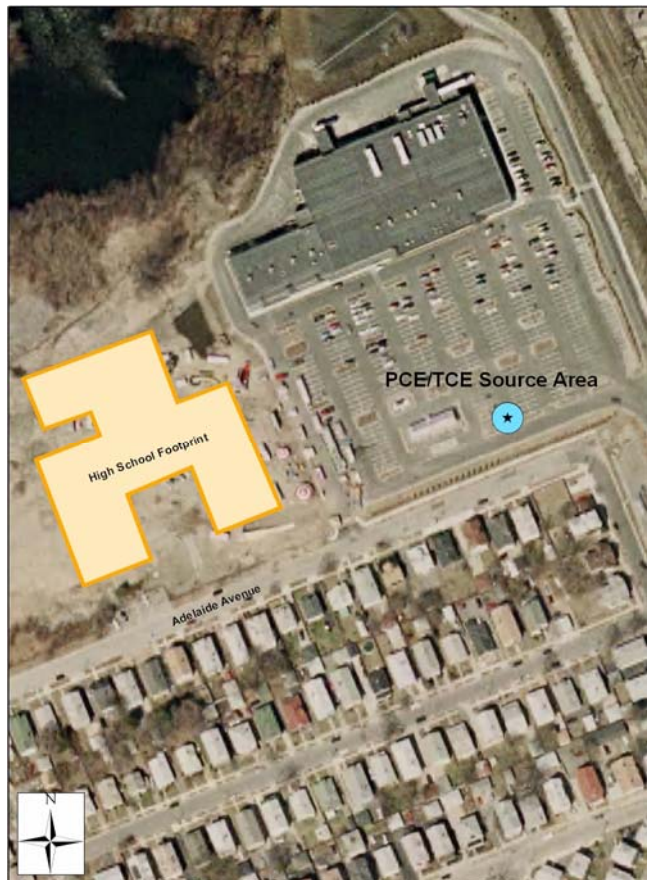
Figure 1. Parcel B-High School Footprint, Parcel A-Shopping Center, Gorham Site, Providence, Rhode Island.

The School is being constructed on the vacant lot on 333 Adelaide Avenue, Providence, Rhode Island. The property, Figure 1 below, is bounded to the north and west by the Mashapaug Pond, to the south by a residential community and to the east by a shopping center (Parcel A).